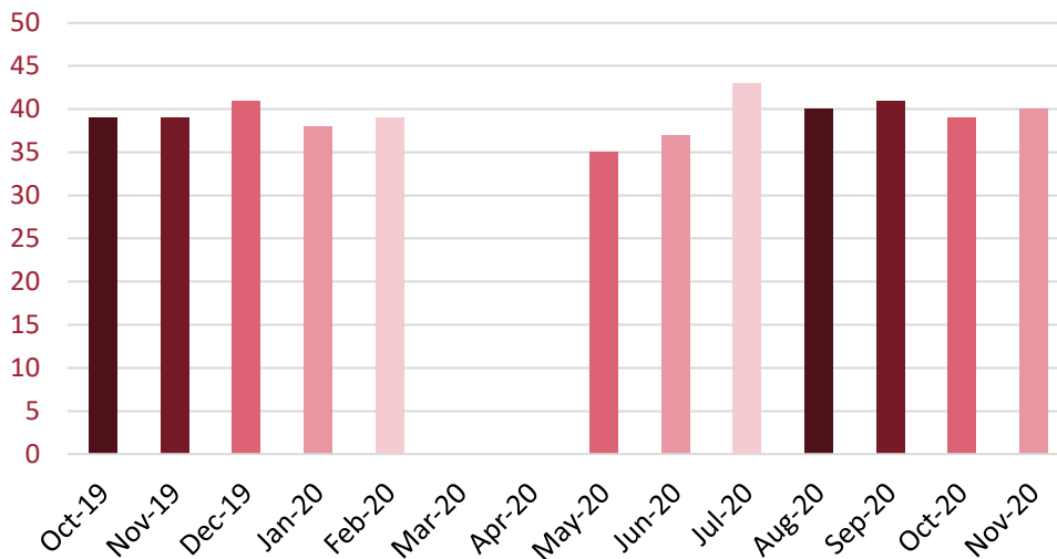
Figure 2: Number of properties available per branch

The number of properties available per member branch stood at 40 in November, rising marginally from 39 in October.