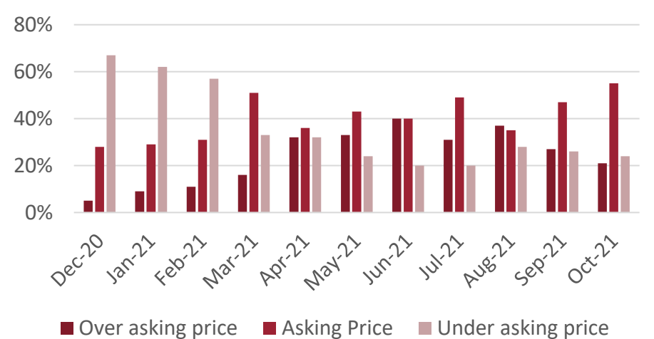
Figure 1: What Properties Sold For

In October, the majority of homes agreed sales at the original asking price (55 per cent). This continues to show a shift away from properties predominantly selling for over the asking price. In September, 27 per cent of homes sold for over the asking price. Conversely, in October, just 21 per cent of properties sold for more than asking price. Before March 2021 it had been the norm for the majority of properties to agree sales at under asking price.