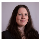
Emma Roddick Scottish National Party