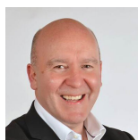
Deputy Convener Willie Coffey Scottish National Party