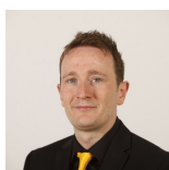
Fulton MacGregor Scottish National Party