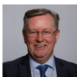
Alexander Stewart Scottish Conservative and Unionist Party