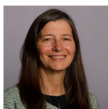
Convener Ariane Burgess Scottish Green Party